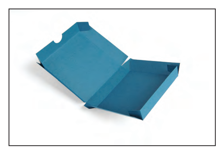
2. Fold all creases in the same direction