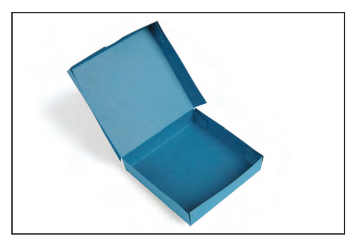
3. Adhere the corner tabs to the inside of the adjoining panels. Attach the center or back tabs to the section that will become the bottom of the box.