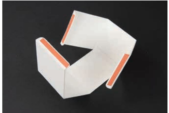
2. Connect the two panels.