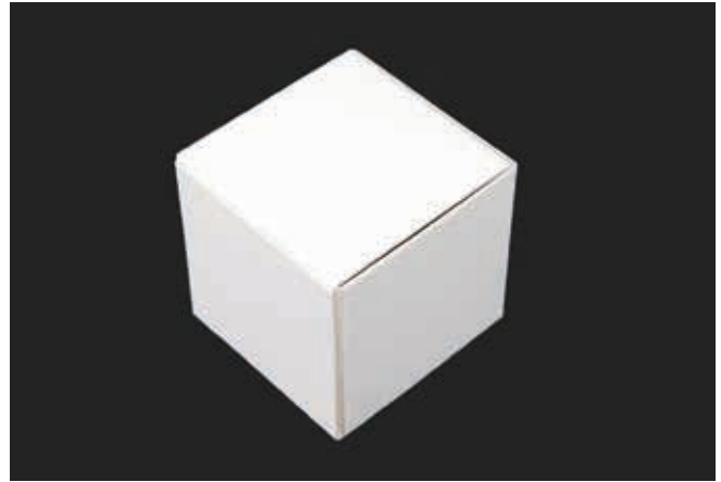
4. Embellish as desired.