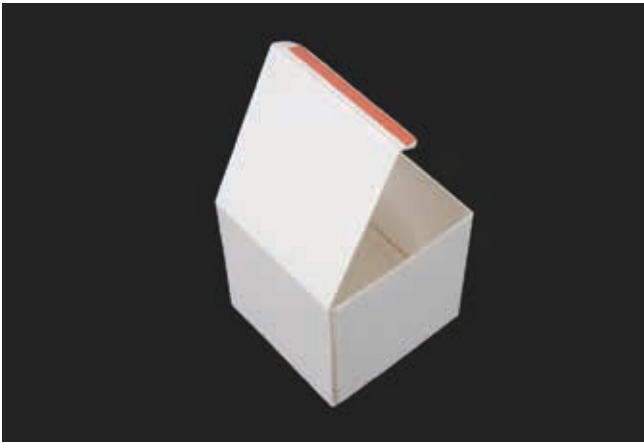
3. Close the top of the Box.